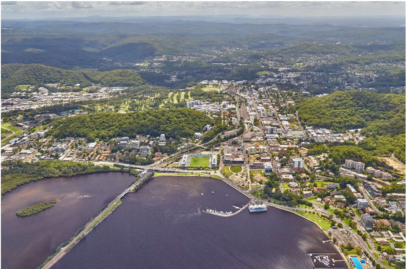
Figure 2: Aerial image of Gosford.