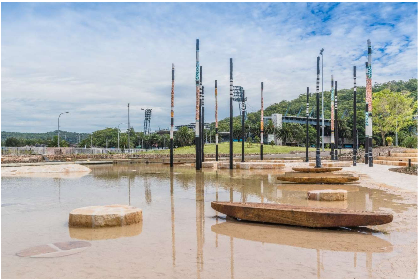
Figure 4: Gosford Leagues Club Park.

Meetings and workshops are generally held via Microsoft Teams, or in Gosford City Centre.