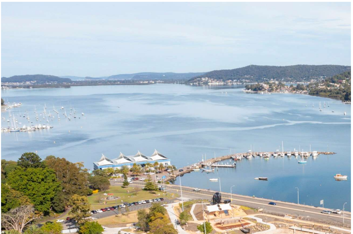
Figure 3: View from Gosford across Brisbane Water.

The proponent must prepare a design excellence statement, which will be considered by the Panel as part of its consideration of whether the proposal exhibits design excellence and whether a design competition is necessary (under clause 5.46(4) of the Precincts-Regional SEPP). For details on the requirements of design excellence statements, refer to Attachment C of this Guide.