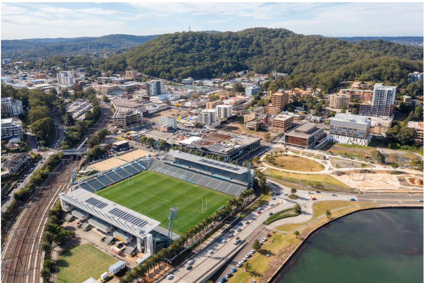
Figure 6: View of Gosford Stadium and Leagues Club Park.

The 3D model information needs to be submitted at least five (5) working days prior to the meeting/workshop to give Council sufficient time to update its 3D model.