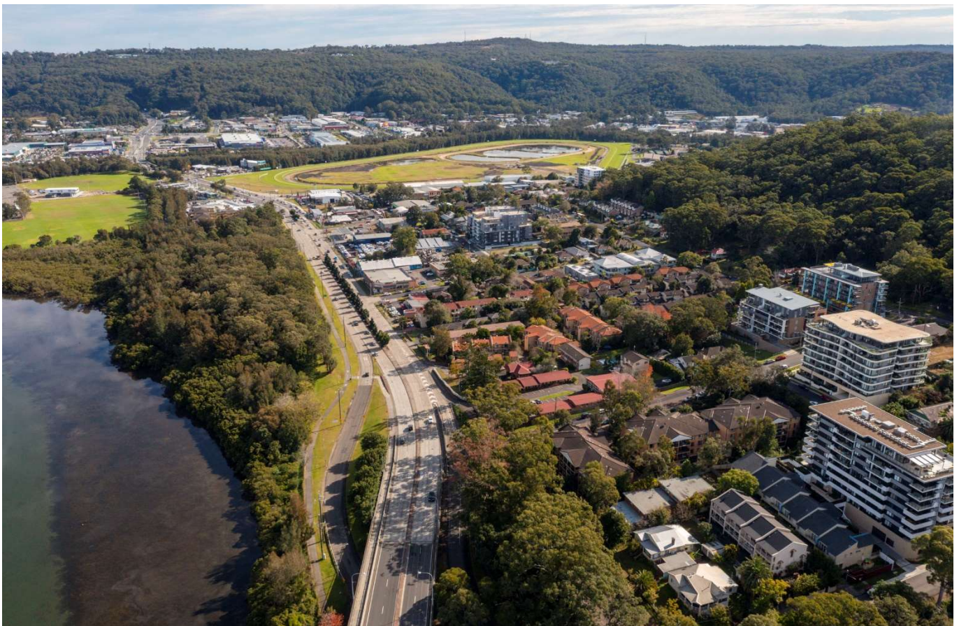
Figure 5: View of Gosford looking towards the Racecourse.

The Panel's pre-lodgement recommendations and advice will be made publicly available during the development assessment exhibition period once a Development Application has been lodged.