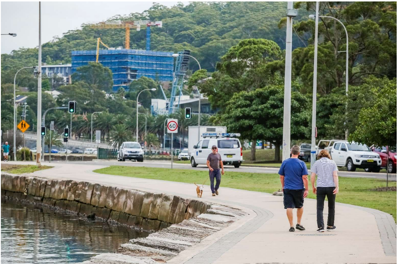
Figure 1: Gosford Waterfront.

The Panel has been established to support the revitalisation of Gosford City Centre and will provide advice on urban design, architecture and landscape design for development proposals. This document will help stakeholders understand how the Panel operates and how it will ensure design excellence and quality design outcomes for Gosford City Centre.