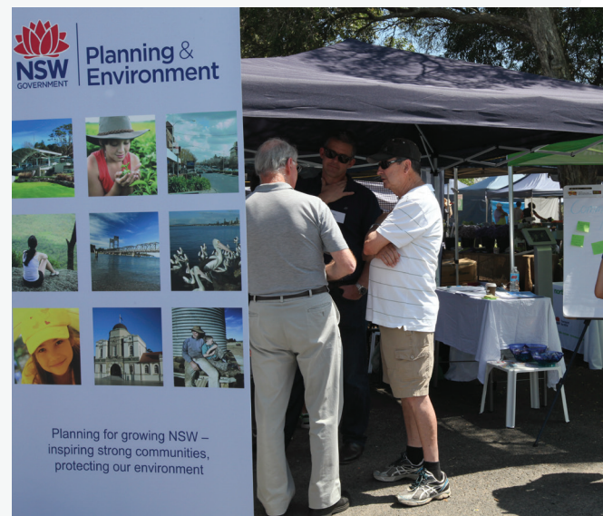
Community information stall

The Community Consultation Report on our website provides further details.