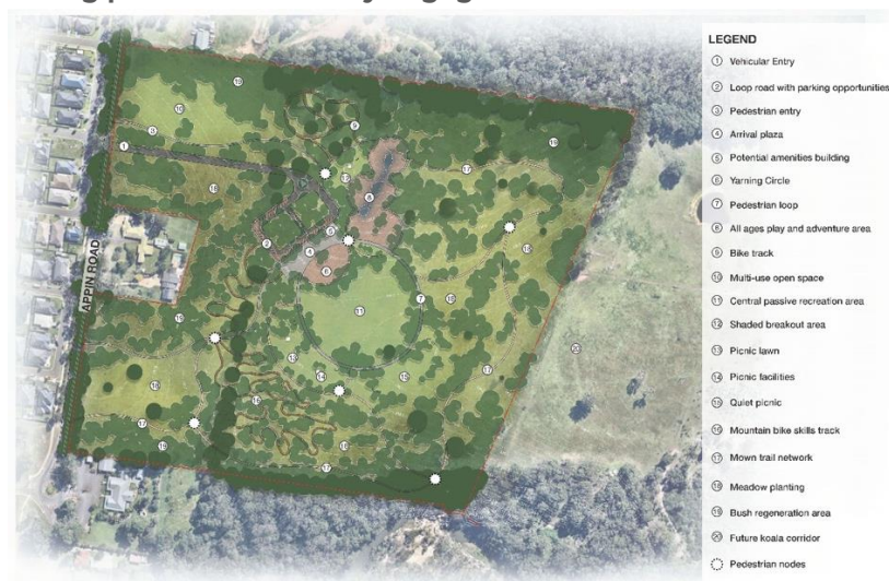
Figure 2: Draft Concept Design presented to the community during phase 2 community engagement

Most importantly, all participants felt that the proposed design gave appropriate consideration for the care of the neighbouring bushland and koala population. This high regard for nature was a theme that was further reflected in phase 2 participants' preferences for the design of public art and play spaces within the Park.