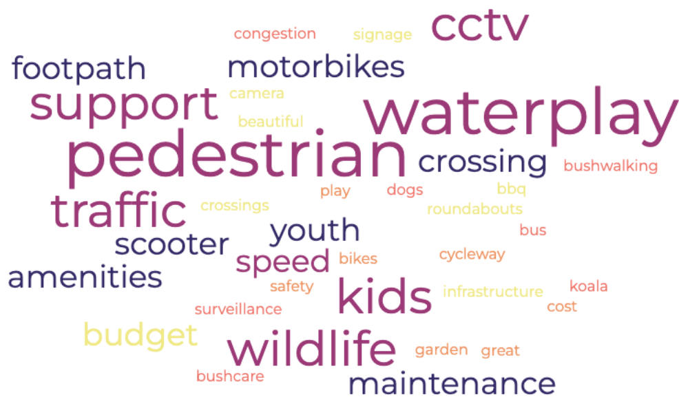
Appendix Figure 2: Phase 3 Engagement Word Cloud

The following word cloud was created using the most common words to convey the community's feedback for the design of the new Park.